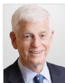
MARIO J. GABELLI, CFA Chief Executive Officer GAMCO Investors, Inc.